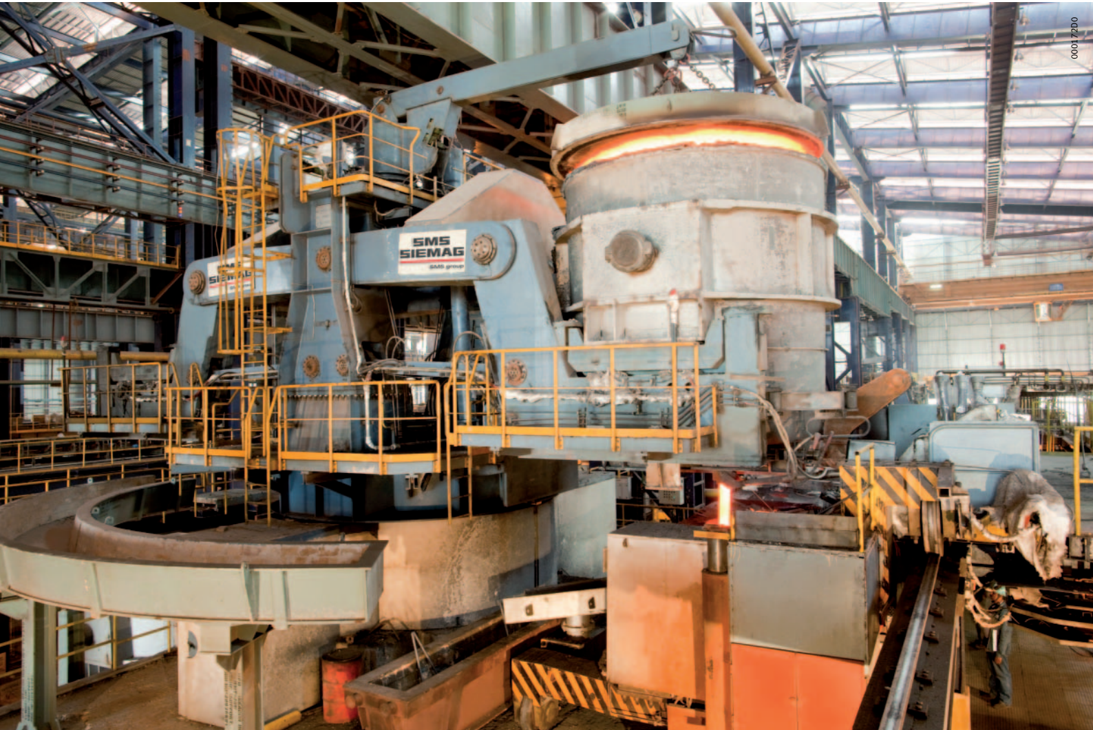
Figure 1 · Ladle turret

With its CoCaB range ( C ontinuous C aster B earings), the Schaeffler Group offers bearing solutions that precisely fulfil the requirements of continuous casting plant.