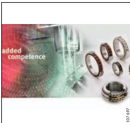
Figure 3: AC 41 130

Shortening the grease distribution process has the effect, through reduction in mounting time, of reducing costs. Optimum positioning of the grease increases the reliability of the grease distribution process especially where, due to the comparatively low maximum speeds of the subassembly, only small centrifugal forces occur and the grease would require more time to reach the outer ring. The reliability of spindle operation is dependent to a significant extent on optimum grease distribution in the bearing. In this way, factory optimisation of greasing improves the viability of the entire machine tool.