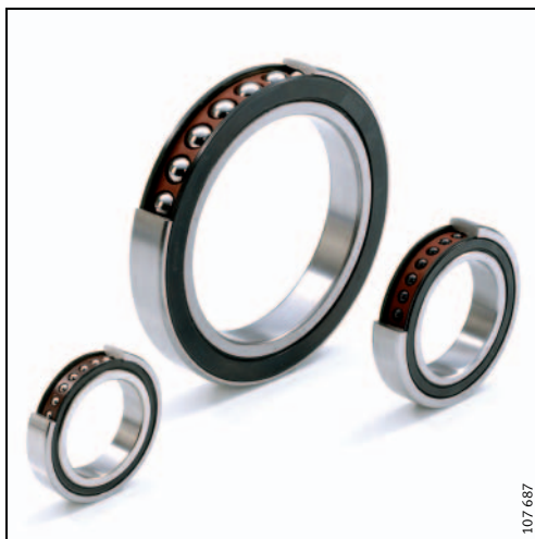
Figure 1: Sealed FAG spindle bearing