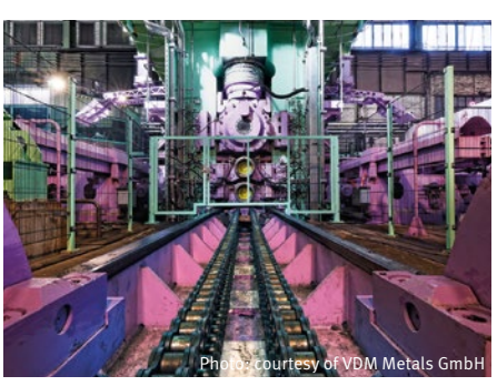
Side view of four-high stand